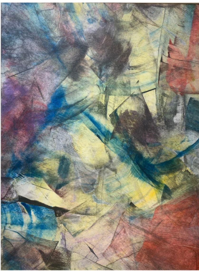
kaleidoscope encaustic monotype 18" x 22", $325 framed