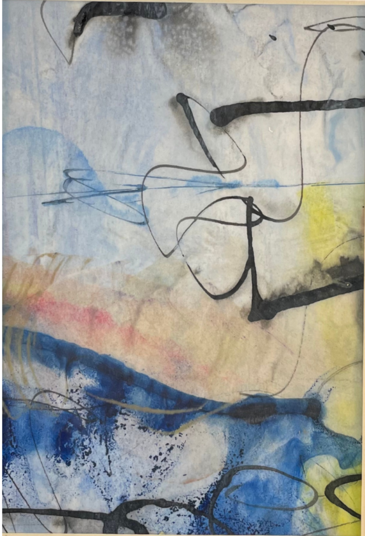
beach day encaustic monotype with india ink 10" x 12", $85 framed

Below are some sample pieces that will be for sale. I hope you can join me on December 3 or stop by at your leisure.