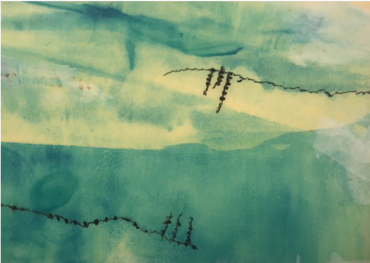
holding encaustic monotype 16"x12" framed, $150 framed