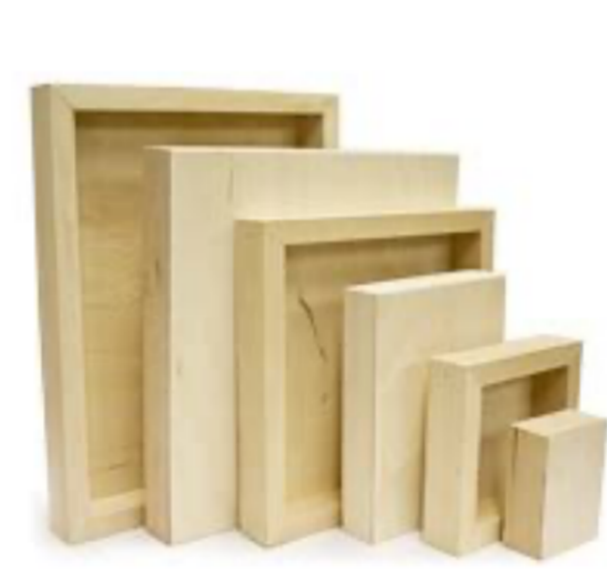
front and back of cradle panels

Created from wood, a cradle board or cradle panel has a flat wooden surface reinforced with wooden strips on the back and around the sides. This reinforcement creates a rigid surface and prevents warping. The reinforcing strips generally have a depth between 1 1/2 to 2 inches. Cradle panels are readily available in many sizes or can be handmade should you need a custom size. The larger the panel, the more reinforcement needed, and often additional strips are added in the back; generally, a panel longer than 24 inches in any direction should have reinforcements. Artists often work on shallow cradle board and then frame a piece. Alternatively, a cradle panel can be painted on the sides and mounted directly on the wall.