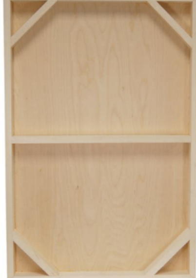
back of a large cradle board

The beauty of a cradle board is that most art on paper or other bendable surface, such as canvas or linen, can be glued to the surface of the panel. The sides of the cradle board can be painted with a good acrylic paint or even leftover wall paint. The mounted artwork is on a raised surface and will hang easily with eye hooks and a picture wire. The piece will hang flat against the wall. There are several videos on YouTube that provide instruction on how to do this yourself. Alternatively, a framer can mount a piece on a cradle panel.