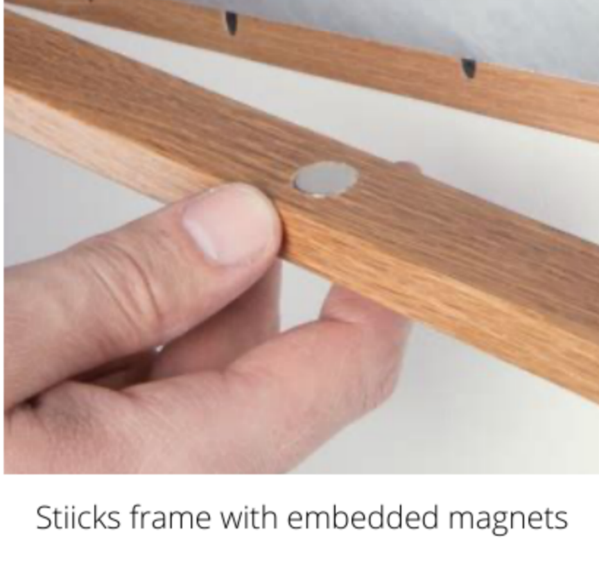
Sticks frame with embedded magnets

A poster frame hanger is a very simple and inexpensive option which uses magnets to create a clamp at the top and bottom of your picture. It works best for hanging art on paper. The back of the piece will be slightly visible, such that an individual could stand to the side of the artwork and look behind. Sticks makes some nice options. Other brands are widely available on Etsy and Amazon.