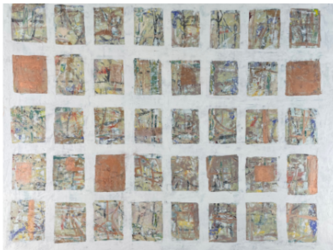
standing moments 17"h x 21"w, framed oil & wax