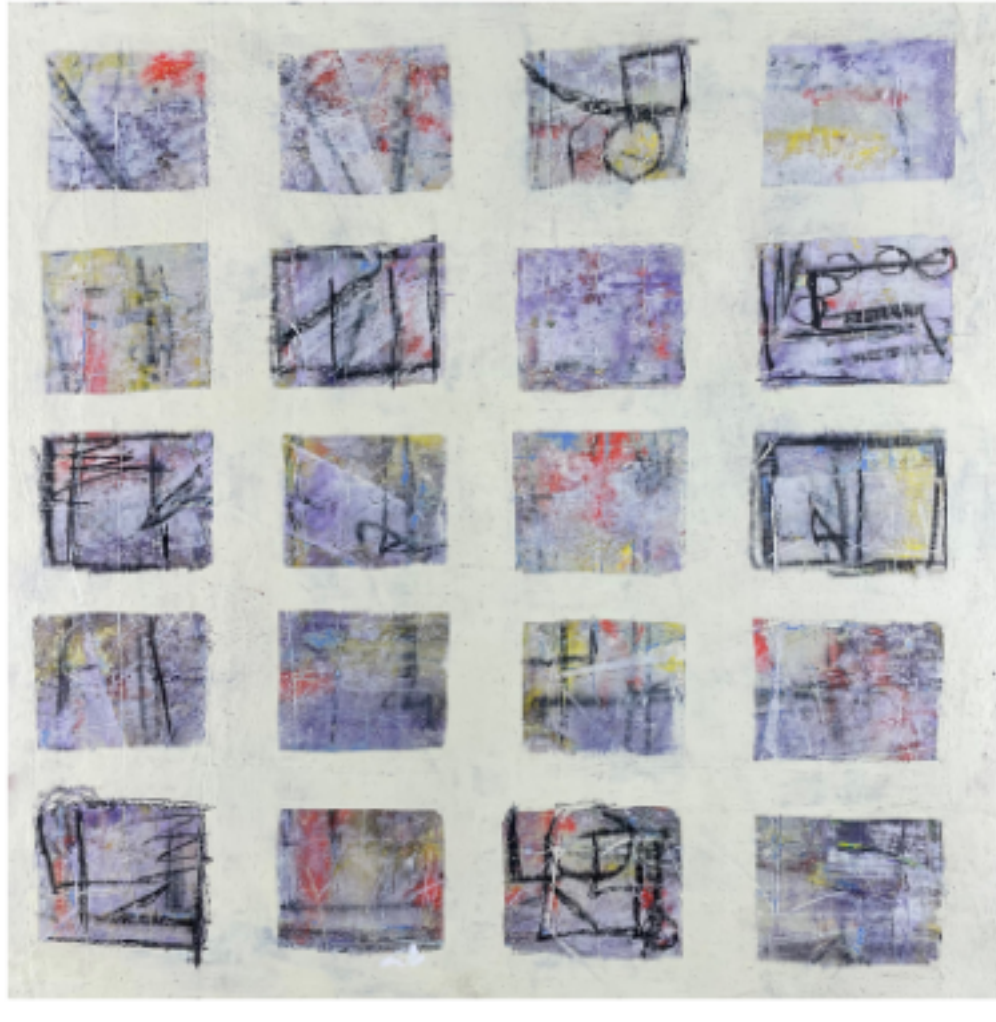
do I really need to think about this 12"x 12" cradleboard oil, wax & artgraf

I've included a few of those paintings below. These are deeply personal pieces speaking to the random occurrences that happen in our lives making each day different from the previous one. Time is perceived differently at various points in our life. Some days fly by, other years drag on. Each of those rectangles in my paintings represent a time interval containing a unique experience - a day full of trouble; a moment when the way we perceive the world shifts forever; a long slog through a project that doesn't seem to end. While the individual rectangles are unique time intervals, together they create a cohesive whole when viewed - almost as if each piece was a calendar.