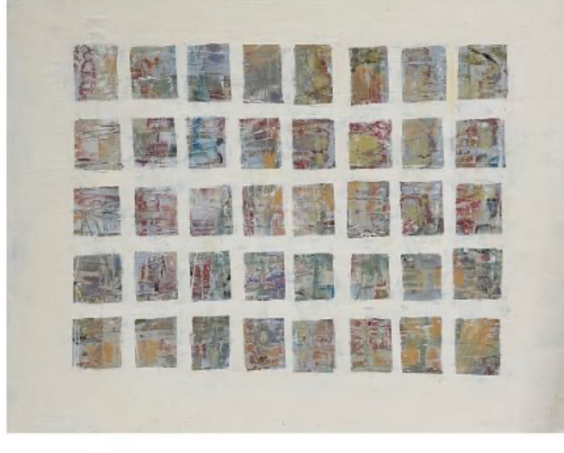
time for it 20"h x 24"w framed oil & wax, $375

Below, I've included the two time series paintings. A full description of this series is further down in this newsletter as many more pieces will be shown at the October show.