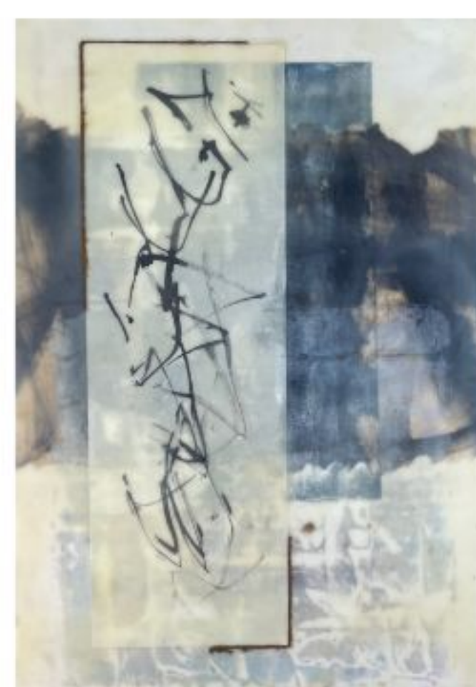
stand up 18"h x 12"w, on cradleboard encaustic

The piece below has been accepted to the 52nd Annual Glen Echo Labor Day Art Show, held in the Spanish Ballroom at Glen Echo Park, 7300 MacArthur Blvd, Glen Echo MD. September 2 through 4, 12 pm to 6 pm.