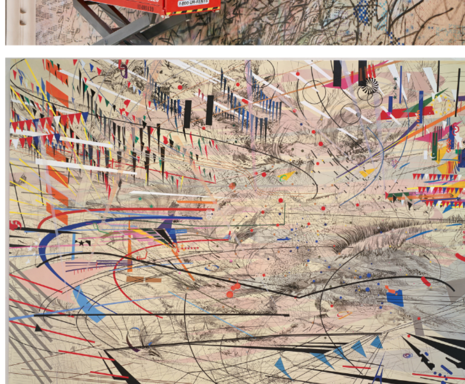
Julie Mehretu's work