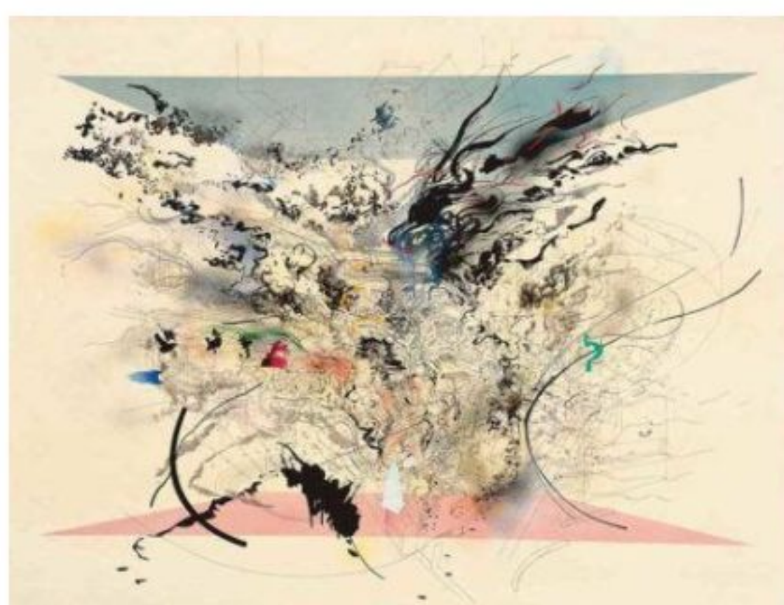
Piece by Julie Mehretu

Rick Rubin, The Creative Act: A Way of Being