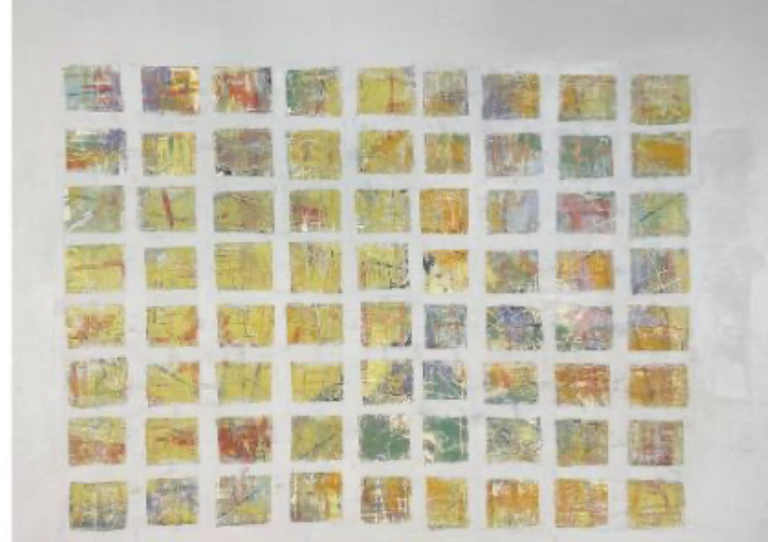
moments in fall 24"h x 30"w framed oil & wax, $775