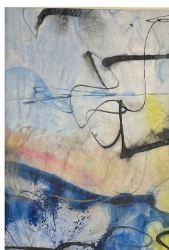
beach day 10"h x 8"w framed encaustic monotype

Two of my pieces were selected for the 24th Annual Wills Creek Exhibition of Fine Art. I am so pleased to be part of this prestigious exhibit running from August 26 to September 23 at the Saville Gallery, Cumberland MD. These pieces are below.